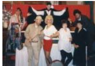
Murder by Moonlight