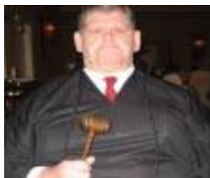
We, the Jury