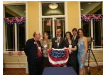
Murder on the Campaign Trail