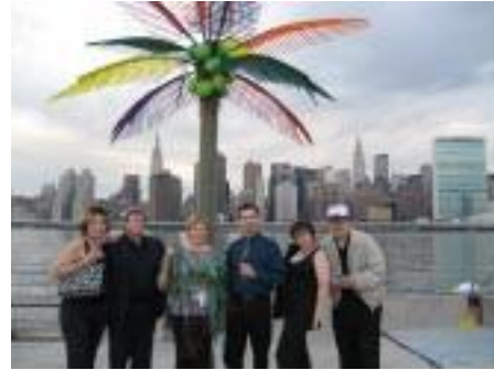
Murder on the Waterfront