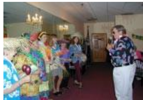
Aloha Means Goodby...Forever